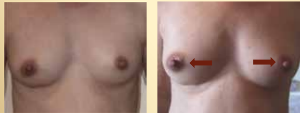
before after 3 months, +6 cm